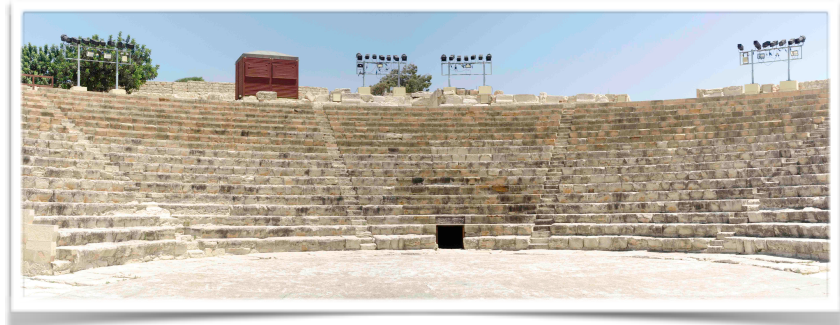
The Theatre at Kourion

With Rome's expansion Cyprus became part of the Empire in 58 BC. The famous writer and orator Cicero was one of Rome's first proconsuls. Briefly Cyprus was given to Cleopatra of Egypt. Under Roman rule roads arrived on the island as well as public buildings such as the theatre at Kourion. For Cyprus this was a long period of peace and prosperity - relatively. It was during this period that Christ was born and the spread of Christianity reached Cyprus. In the year 45 AD the apostles Paul, Barnabas and Mark landed on the island and establishing Bishoprics. Barnabas was martyred in Salamis.